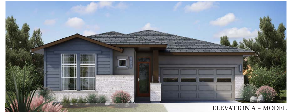
ELEVATION A – MODEL